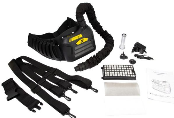
EPR-X1 PPR System