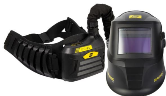
EPR-X1 with Savage A-40 Air Helmet